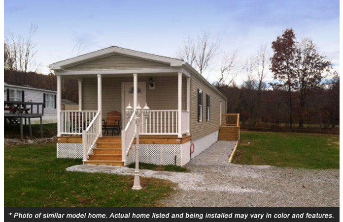
* Photo of similar model home. Actual home listed and being installed may vary in color and features.

Model number: 70S188-HS+4+6P House dimensions: 16' x 76' Bedrooms: 3 Bathrooms: 2 Living space: 1260 sqft. Sale price: $77,900 Rent for: $1,095/mo